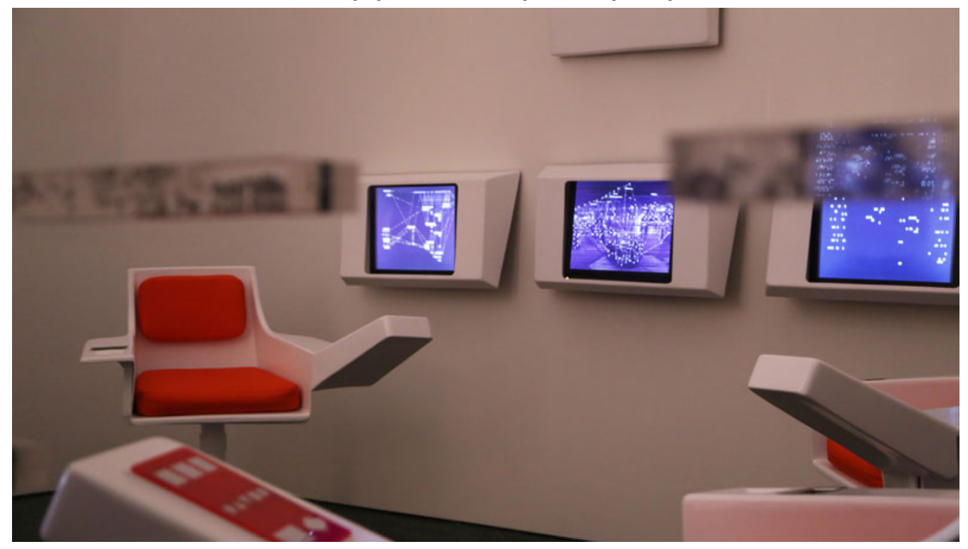
The Counterculture Room at the London Design Biennial, Somerset House.