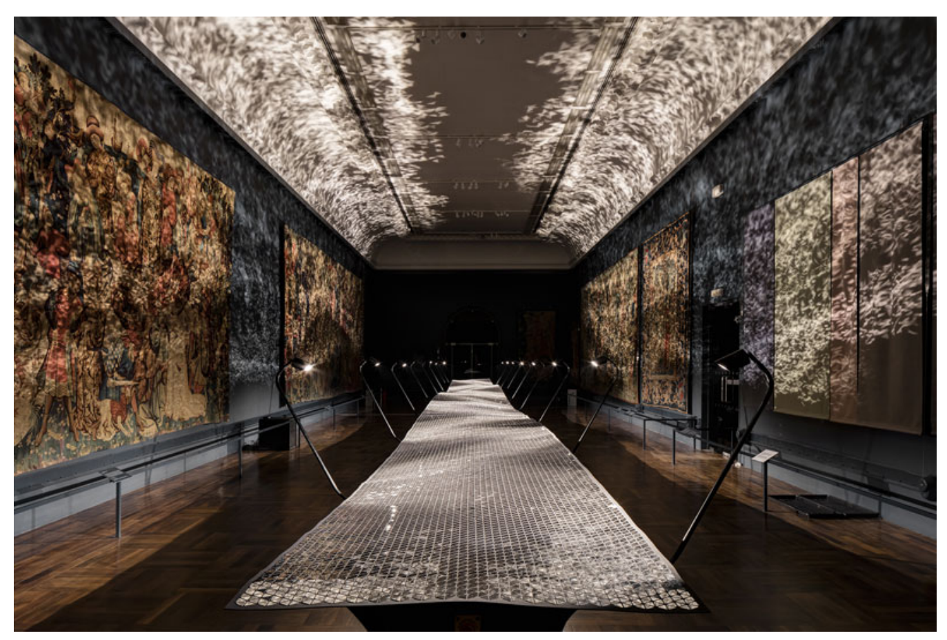
FOIL by Benjamin Hubert of Layer, supported by Braun

from product launches to more conceptual approaches to design and covers more of the city every year: there are now seven design districts to explore, from the original district of Brompton Road to Brixton, this year's addition. Here are some highlights of the exhibition programme: