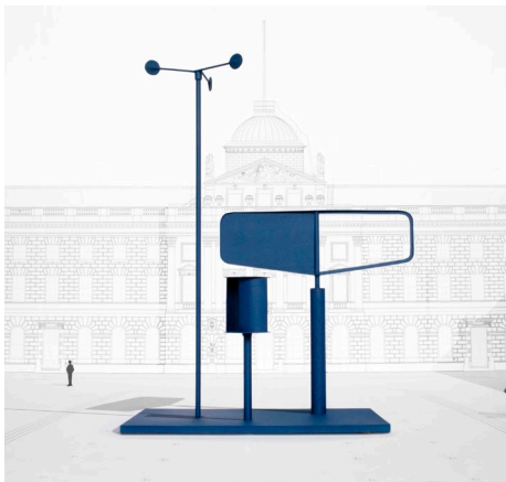
UK: 'Forecast' © Barber & Osgerby

High resolution images and caption sheet available at http://tinyurl.com/h665csy