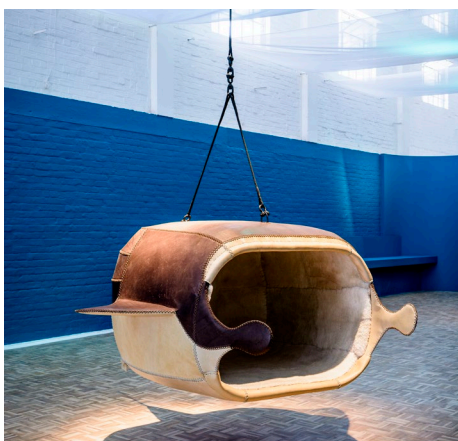
South Africa: 'Otium and Acedia'. Image: Porky Hefer, 'M.heloise'.