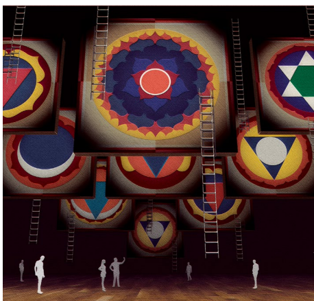
India: 'Chakraview' © India Design Forum / Sumant Jayakrishnan