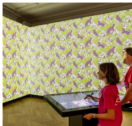
USA: Installation view of 'Immersion Room'.