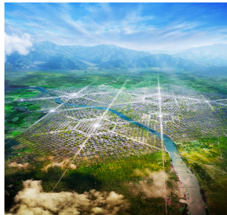
Mexico: 'Border City' aerial view