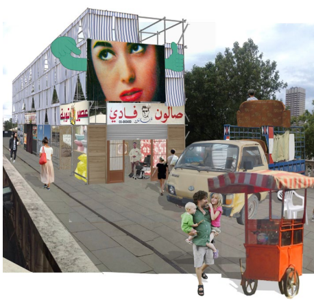
Lebanon: 'Mezzing In Lebanon' © AKK Architects